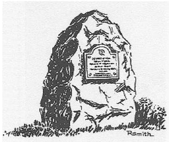
Photo - 1992 Historical Marker